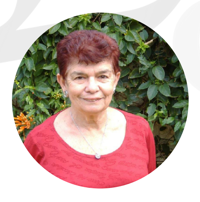
Director CimeH Institute Israel