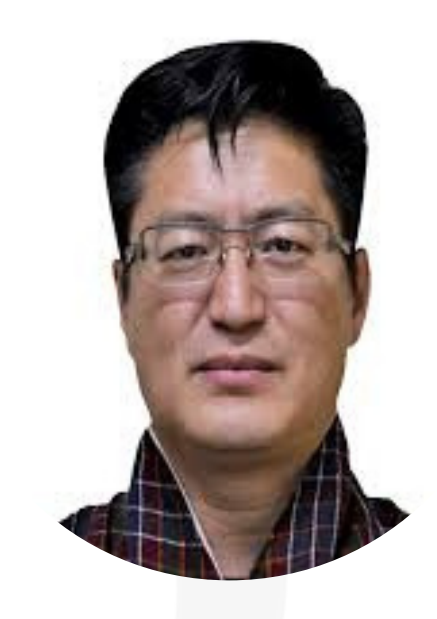
President Samtse College of Education Bhutan